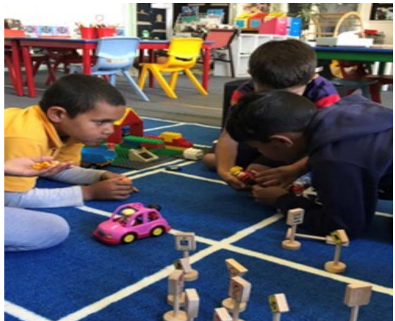
It was great to be back with our class mates.