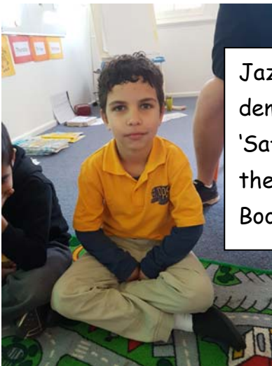
Jazhech demonstrates what 'Safe sitting while in the world of the Book' looks like.