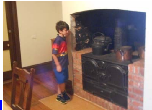
The kitchen in Rio Vista House.