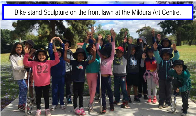
Bike stand Sculpture on the front lawn at the Mildura Art Centre.