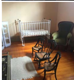
A bedroom upstairs in the house.