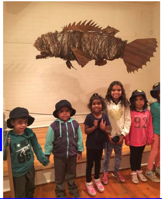
We all did a great job at respecting the house and not touching things.