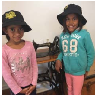
An old sewing machine.