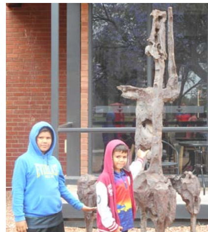
Sculptures at the Mildura Art s Centre.