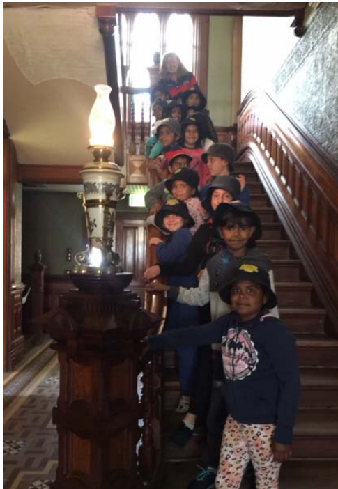
We were all going upstairs to see the bedrooms.