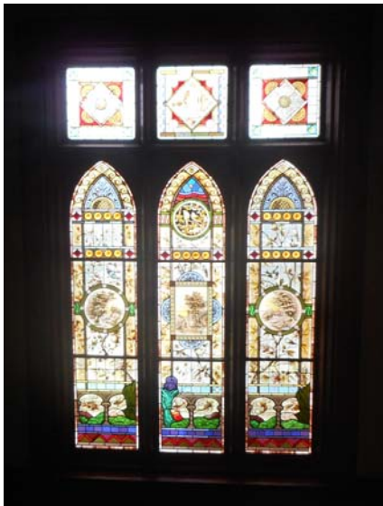
We were amazed by the stained glass windows.